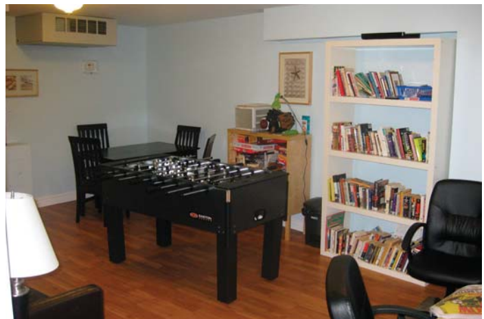
Safe Beds common room and recreation area.

such as case management, financial support (i.e. ODSP, Ontario Works) and permanent housing for when they move back into the community.