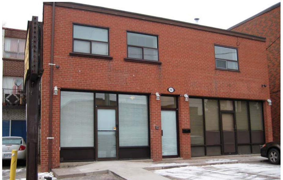
Safe Beds Building exterior.

"It creates the opportunity for a lot of social interaction between the clients and the staff. At any time you can find clients together playing foosball, cards, or watching movies or sporting events on TV. It gives it a nice homey feel."